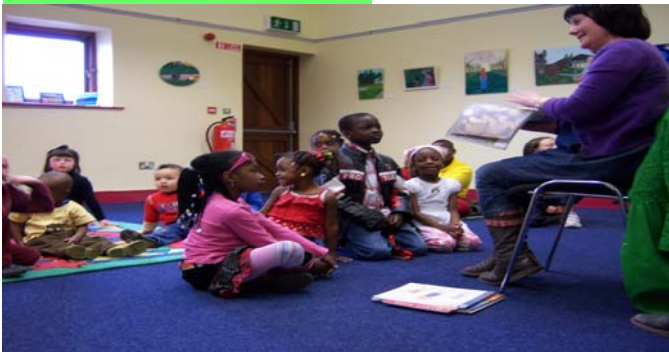
Above children enjoying the talents of the Storyteller at the launch in Westside Resource Centre.

Residents from Lisbrook House also participated in the festivities.